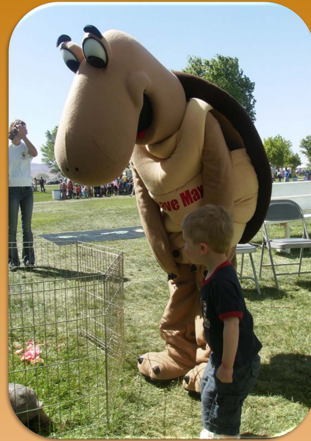
Figure 3 The Mojave Max mascot is a character that was created for public outreach and education purposes.