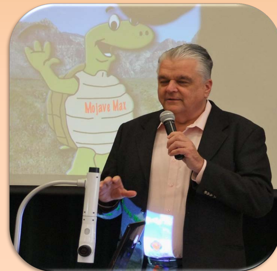
Figure 2 Commissioner Sisolak addresses the students at Hummel Elementary School