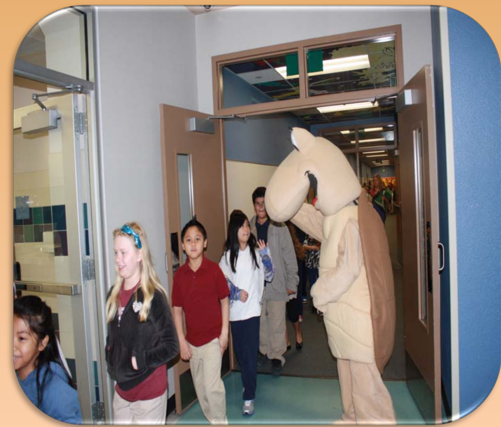
Figure 1 Mojave Max greets the students entering an assembly at Evelyn Stuckey Elementary School.

Created by the DCP, and named through a school naming contest, the Mojave Max cartoon character was developed in 1994 and quickly became a Las Vegas icon. Additionally, a live desert tortoise named Mojave Max lives in a new habitat at the Red Rock Canyon National Recreation Area.