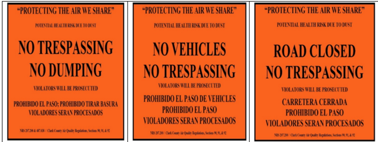
Figure 1: Examples of Signage