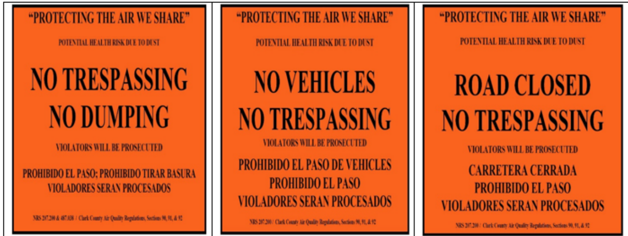
Figure 1: Examples of Signage