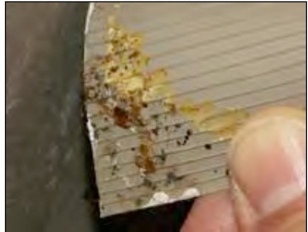
Bed bugs and residue on back of vinyl molding.

Prevent the spread of bed bugs by following these steps and talking about it. Ask for help!