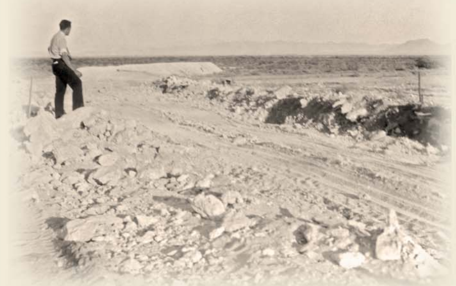
A worker looks toward Sunset Park and Railroad Pass from the junction of the Boulder Branch Railroad and the Union Pacific main line.