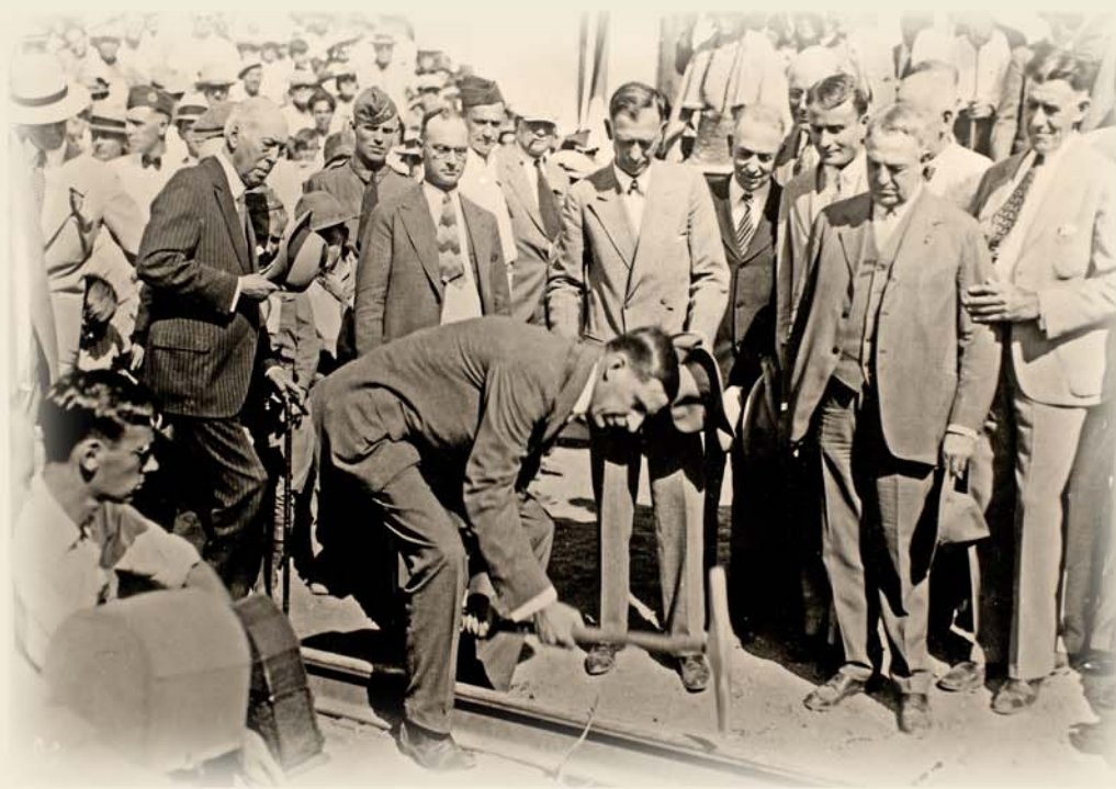
Secretary of Interior Ray Lyman Wilbur drives home the silver spike to begin construction of the Boulder Branch Railroad to Boulder City townsite, September 17, 1930.

The track left the main line about six miles south of Las Vegas and angled across Paradise Valley to Railroad Pass. The beginning of this project was celebrated nationally and locally. Secretary of Interior Ray Lyman Wilbur traveled to Las Vegas to drive home the silver spike that joined the first rails at a special ceremony held along the tracks.