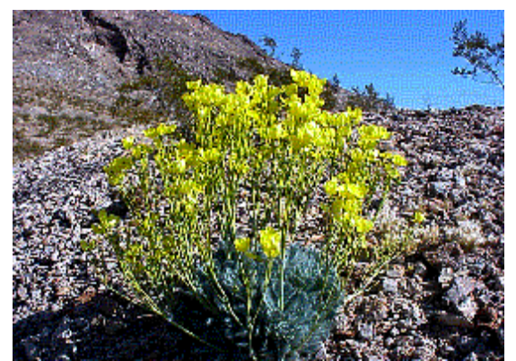
Las Vegas Bearpoppy (Arctomecon californica)

$94,000 Note: This project was amended to also include 1999-BLM-1-G, Plant Inventories.