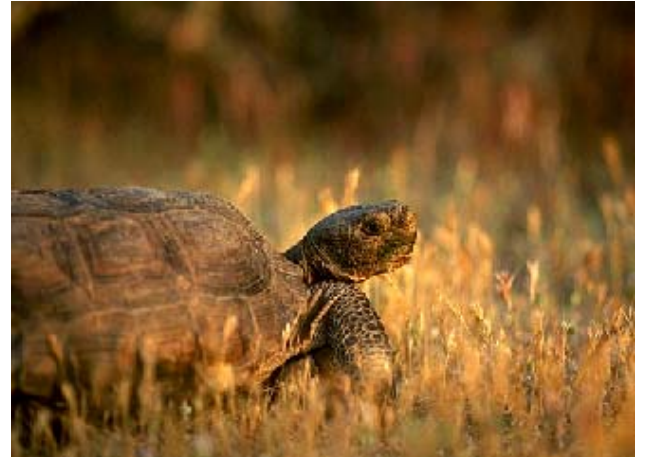
Desert Tortoise (Gopherus agassizii)