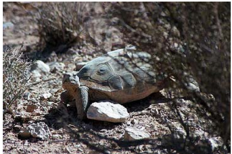
Desert Tortoise (Gopherus agassizii)