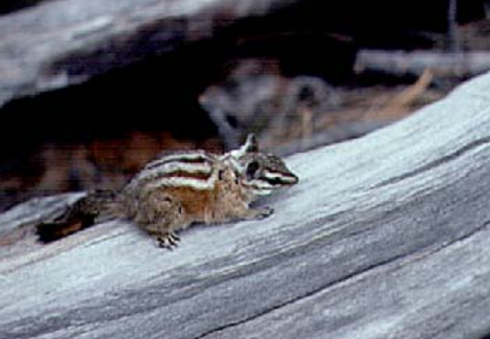
Palmer's Chipmunk (Tamias palmeri)

Species inventory and monitoring projects received approximately $750,000 of the Section 10 funds allotted in the 1999-2001 biennium. The details of each project follow.