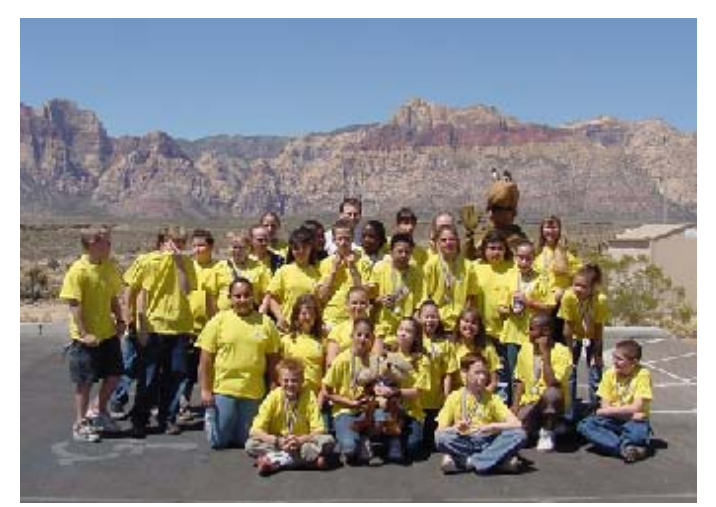
2001 Mojave Max Emergence Contest Winning Classroom