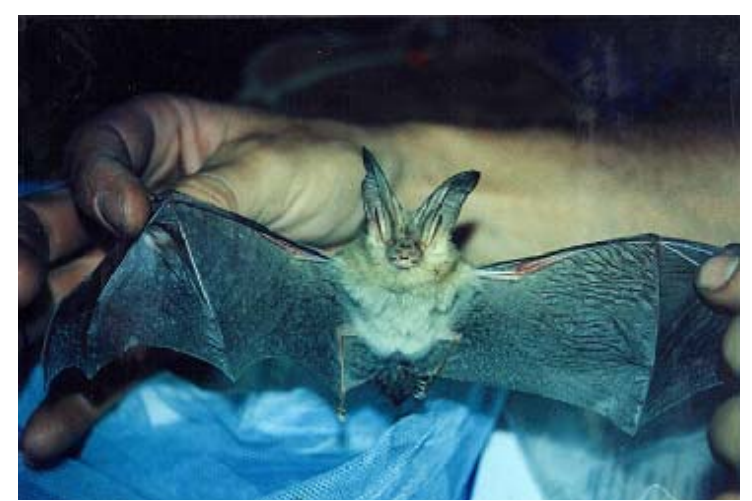
Pale Townsend's Big-Eared Bat (Corynorhinus townsendii pallescens)