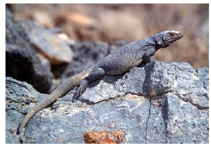
Western Chuckwalla (Sauromalus obesus)