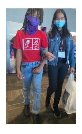
Gentlemen by Choice escorting our guests to their tables