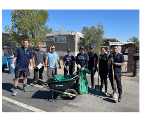
June 10<sup>th</sup> community clean up event