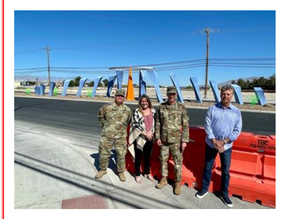
Thank you, Nellis Airforce Base, for your continued partnership

On May 24, 2021, an art sculpture was unveiled near the gateway to the Nellis Airforce Base in North Las Vegas. The 130 ft. sculpture was named after a term which is used to indicate the highest altitude at which an aircraft can sustain flight.